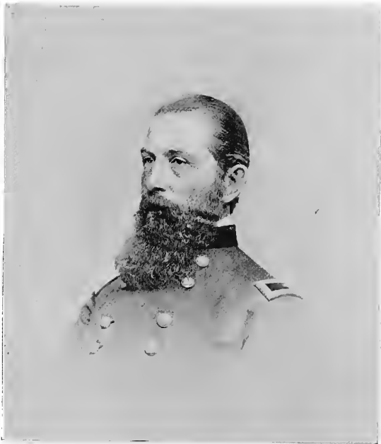
GENERAL D. A. RUSSELL